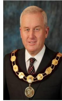
Don Mitchell Mayor

575 Rossland Road East, Whitby, ON L1N 2M8 www.whitby.ca